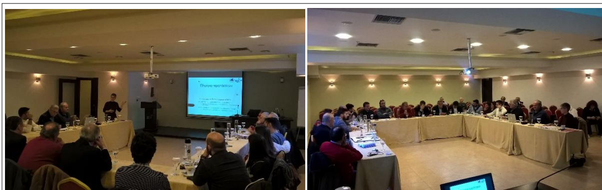
Figure 1 Regional meeting at Mouzaki Palace venue

Participants: The meeting was attended by 22 participants (fig.1). The profile of the participants was: Local public authorities, regional authorities, Decelopment Agencies, National Parks representatives, agricultural experts, local farmers and the rescsearch team from the University of Thessaly (Annex 1).