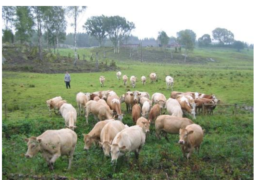
Figure 7