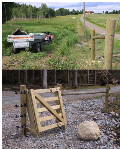
Figure 3 & 4

All individual operations have been developed so that they generate as high HNV-effect as possible and could both lead to maintenance and improvement of HNV values.