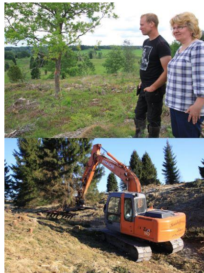
Figure 1 & 2

The entrepreneurial firm participating in most HNV-restoration projects has been working with app. 200 ha semi-natural grasslands. Sometimes the land owner want a prime contractor, sometimes services for specific measures. All different parts needed for a successful restoration is delivered, but based on needs and the level of ambition. The firm can also support with grazing animals during the restoration project and take responsibility for the sometimes quite complex administrative work. Altogether, this firm has worked with app. 30 land-owners during the project period. FOCLUM-PRP has proven to be an efficient tool to implement the goals which the FOCLUM-process and the FOCLUM-LUP-tool has generated.