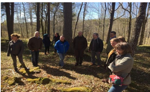
Excursion to a restored HNV pasture during the Innovation Seminar

During the Innovation Seminar the team focused on what types of innovations are needed to reach the shared vision. The team's basis for this workshop was that innovations are needed in many areas but the capacity for stakeholder cooperation is crucial to success. If the team is able to develop new social innovations of cooperation, then a lot of practical and organisational innovations will develop simultaneously.