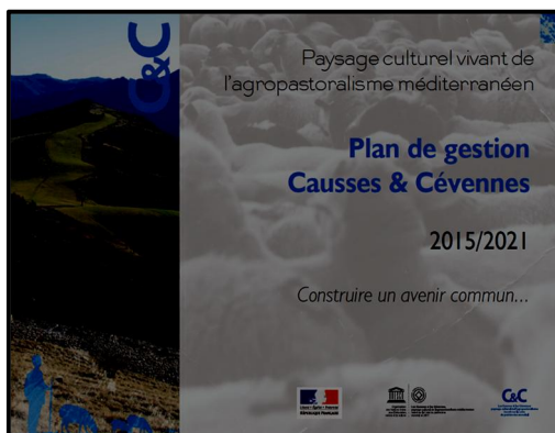
Illustration 2: Management plan

In accordance with UNESCO guidelines that encourage party States to ensure the participation of a wide variety of actors, site managers, local and regional authorities, local communities, non-governmental organisations (NGOs), other stakeholders and interested partners, a specific governance for the management of this site has been put in place since 1 July 2012. It is organised around three authorities: the Area Conference, the Guidance Committee, and the Technical Taskforce (Interdepartmental Alliance Causses & Cevennes).